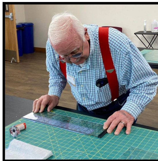
In-Stitches participant using quilt ruler.