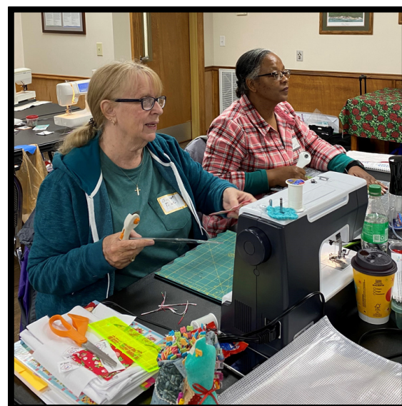
In-Stitches participants sewing on quilt squares.

Facebook Wayne County Cooperative Extension Family and Consumer Sciences