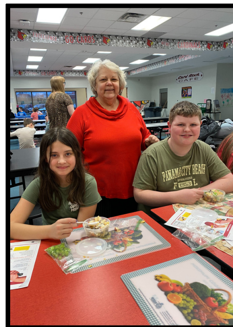
Teens enjoying their Waldorf Salad.

The curriculum addresses key concepts about nutrition, food preparation and cooking, food safety, and physical activity using approaches and strategies that enhance learning and behavior change among teens.