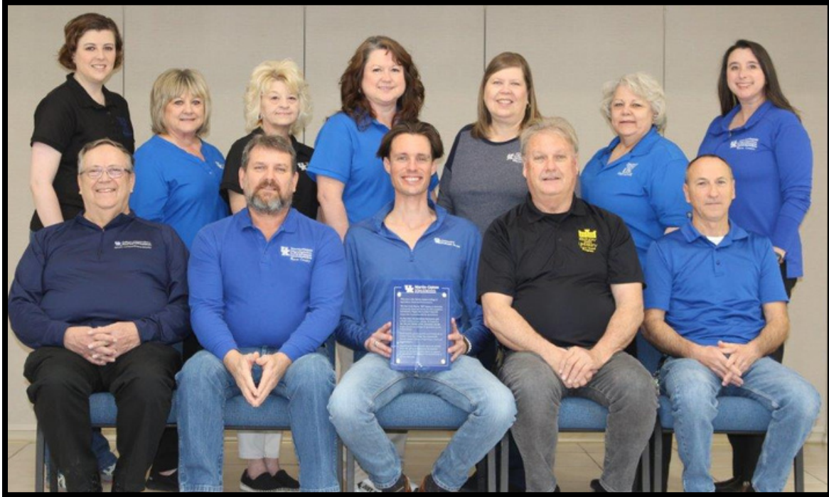
Wayne County Cooperative Extension Staff