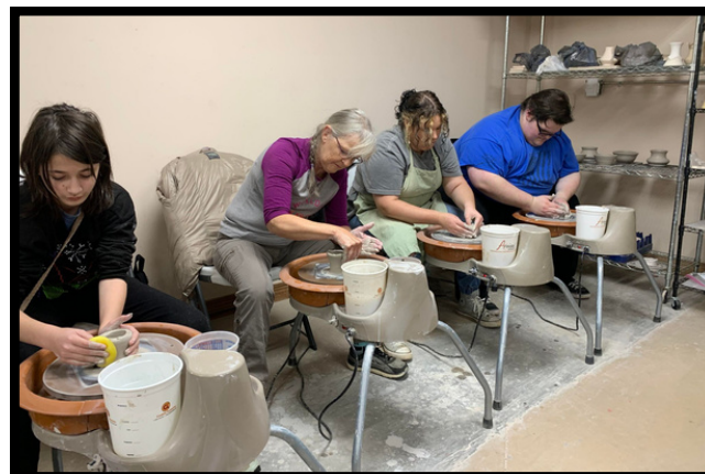
Participants using wheel throwing techniques in the pottery workshop.

This past year, with the help of volunteers, he also restored two of our own Barn Quilts that are now remounted at the Extension Office, one entitled "Extension for All Seasons, for All Ages" and the other entitled "Commemorating 100 years of Extension."