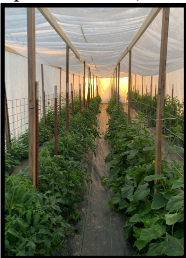
Tomatoes and cucumbers being grown in high tunnel.

On very cold nights we ran portable gas heaters to prevent freezing. We were able to do that well into January. The cucumbers did okay, but the beans and tomatoes did not have enough natural light to produce, and we did not have enough electrical service to run grow lights. We like the versatility of this method over the low tunnel and will use this for spring planted vegetables next year and will plant tomatoes, beans, and cucumbers August 25th for a fall crop. The broccoli, cabbage, and cauliflower did well without extra protection.