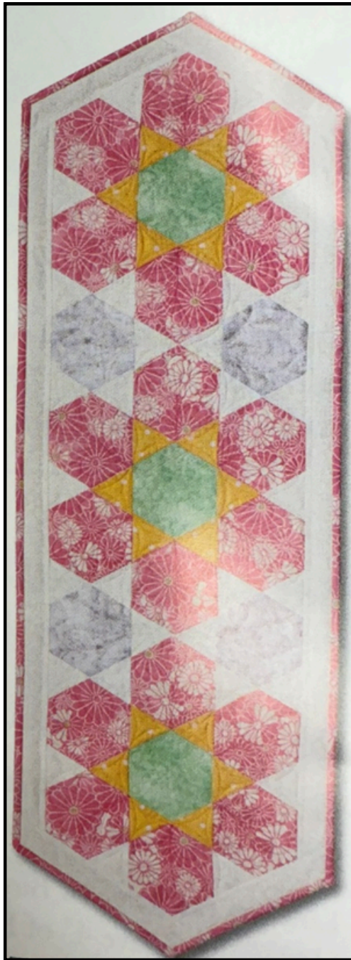
14" x 42" Honeycomb Table Runner – Eleanor Burns Signature Quilt In A Day